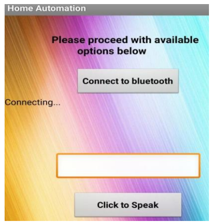
Figure 4: Android Main Page