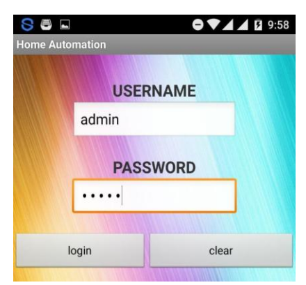
Figure 3: Android Login Page