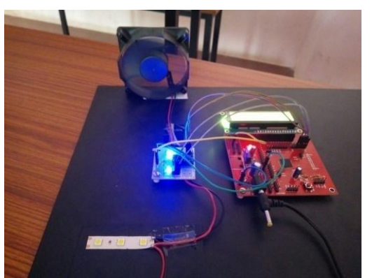
Figure 2: Circuitry for Home automation system